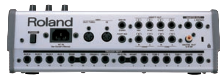
■ TD-20 Rear Panel