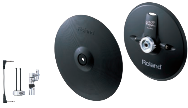
■ VH-12 Components