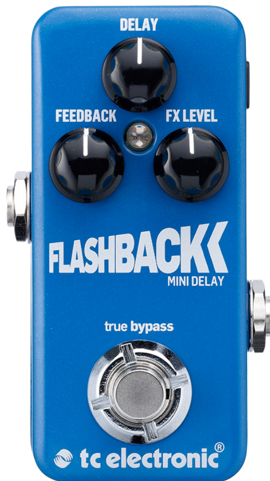
Flashback Mini Delay