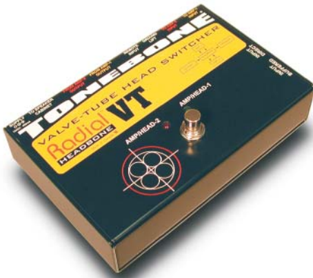
Radial Headbone VT order # R800 7082 Headbone TS order # R800 7083 Headbone SS order # R800 7084

The Headbone is a guitar amplifier switcher that allows two amplifiers to share one speaker cabinet. The Headbone lets you toggle from one amplifier to another without pops, clicks, hum or added noise. For example, the Headbone could switch between a Mesa Boogie™ Dual-Rectifier head and a Marshall™ JCM800 through the same 4-12 slant cabinet.