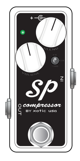
SINGLE COIL CLASSIC VINTAGE