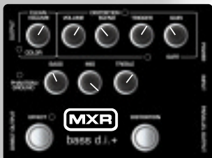
ROBERT TRUJILLO / OZZY OSBOURNE TOBIAS CLASSIC 5

*noise gate, color, and phantom/ground buttons are all depressed down