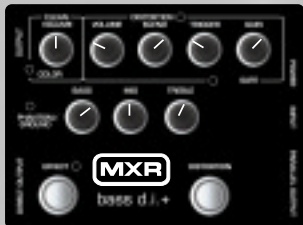
REX BROWN / PANTERRA

To help you get started using your M-80 MXR Bass D.I.+ stomp box, we've provided a roadmap of knobs and switch settings used by top artists*. You're set to play with any of these settings or find your favorite and experiment from there.