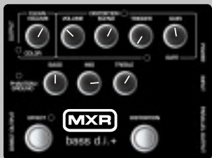
TWIGGY RAMIREZ / MARILYN MANSON