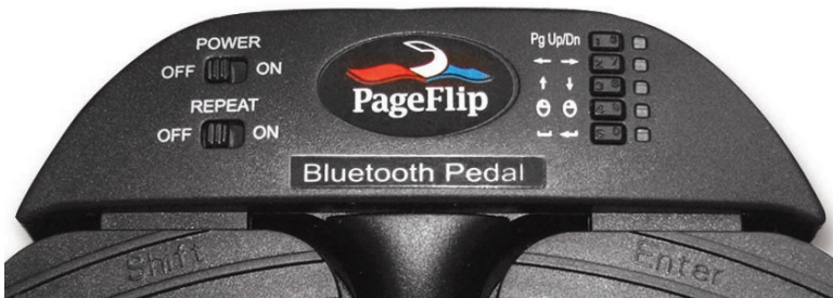
Figure 4: Top view of PageFlip Cicada control panel.