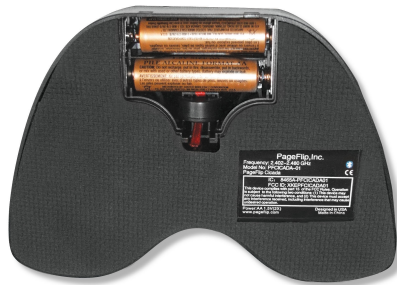
Figure 2: Battery cover is located at the bottom of the PageFlip Cicada. A convenient storage compartment for the Bluetooth dongle lies alongside the batteries.

Note: To conserve battery power, turn off device when not in use. The unit automatically turns off after two hours of inactivity, but can awake instantly upon a pedal tap.