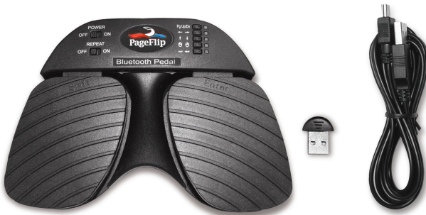
Figure 1: Package contents: PageFlip Cicada, Bluetooth USB micro adapter, and USB power cable.