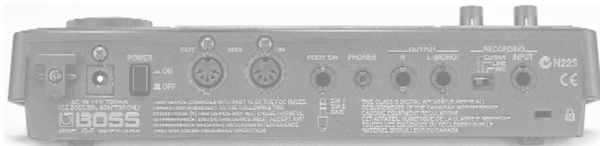
JS-5 Rear Panel

*The specifications are subject to change.