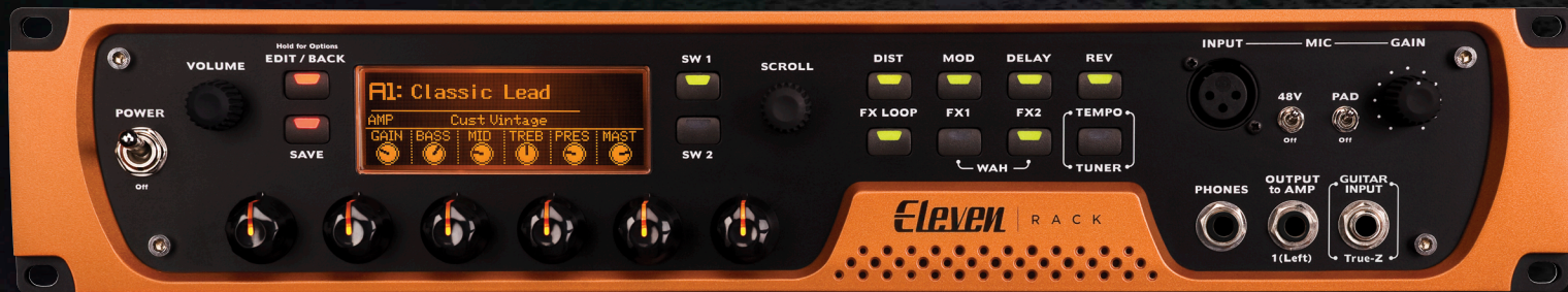
DSP-powered audio interface + standalone effects processor

Eleven™ Rack is a revolutionary new guitar recording and signal processing system designed to solve the challenges guitarists have faced in the studio and on stage. Say goodbye to the lackluster guitar amp “models” of yesteryear: Eleven Rack utilizes a unique tone cloning design and one-of-a-kind, custom-designed True-Z input to re-create the experience of playing through a mic’d amp. By combining studio-standard Pro Tools® software with a DSP-accelerated high-resolution interface that also operates as a standalone effects processor, Eleven Rack puts professional recording and signal processing into the hands of every guitar player.