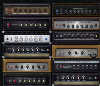
Best-in-class amp, cab, and mic tones