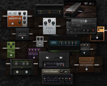
Refined stompbox / rack effects collection

Eleven Rack is based on the same technology as our critically-acclaimed Eleven plug-in. Check out the buzz on the Eleven tone: