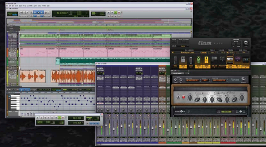
Studio-standard Pro Tools recording and mixing software