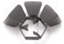
Three MTC-xxH* as Cluster Module Bracket