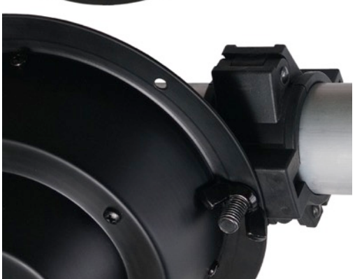
Attach motor to truss with both clamps making sure the motor is fully secured.