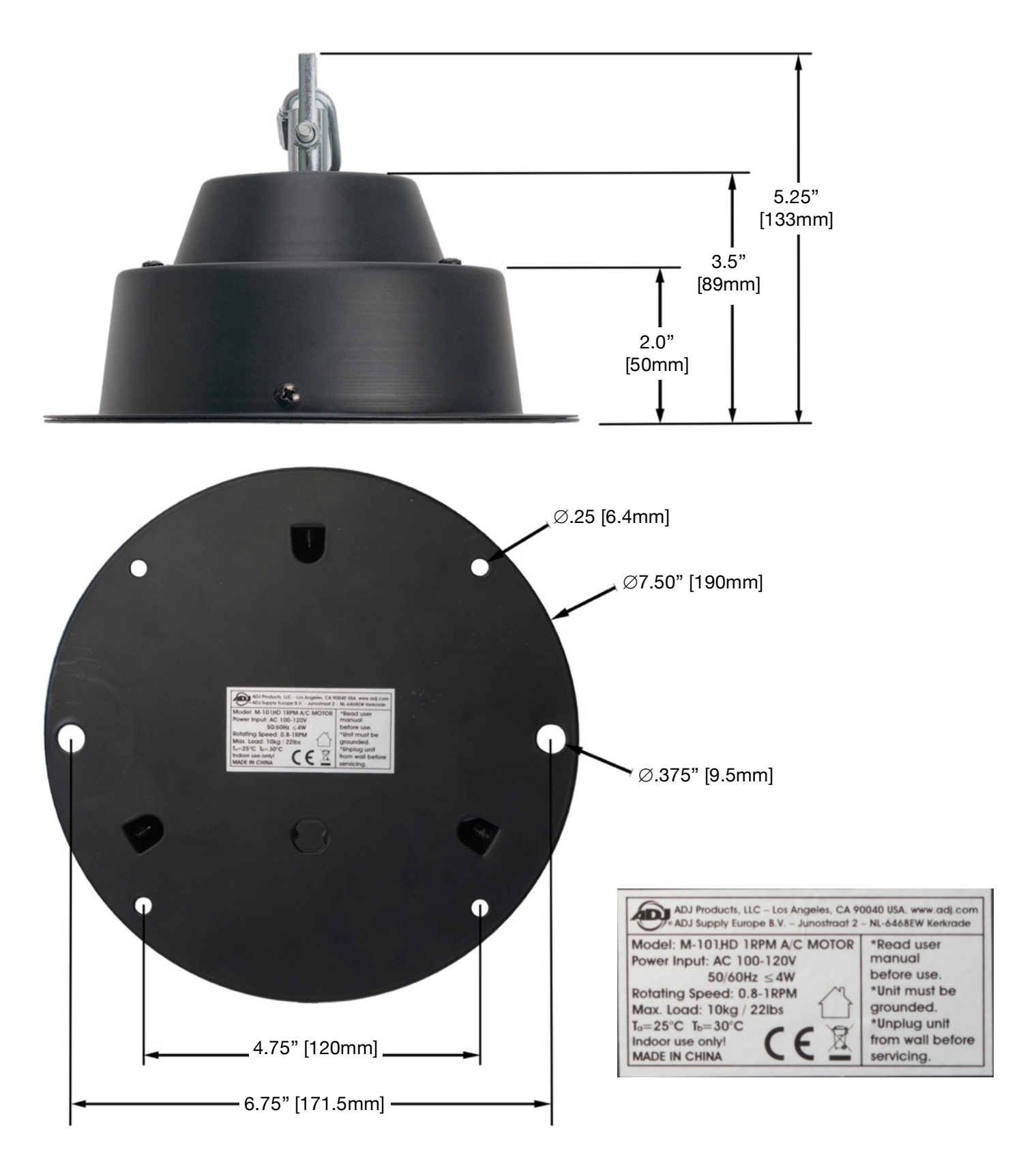
Specifications subject to change without any prior written notice.