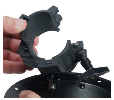
Attach clamps securely to the mounting holes on the motor. Make sure clamps are firmly attached to the motor before mounting to truss.