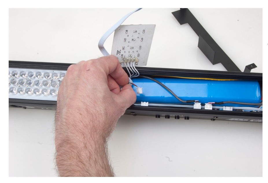
Disconnect the IR sensor cable from the PC board.