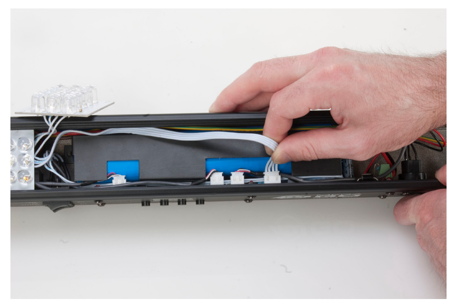
Carefully disconnect the LED wire harness from the PC board.

After disconnecting the wire harness, "flip" the bar over so the rear is facing up. Remove the two phillips screws that secure the battery bracket.