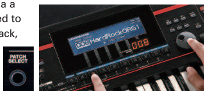
*Connect an optional FS-6 dual footswitch to scroll up or down through patches and performances.

On stage, you need quick and effortless access to your patches. JUNO-STAGE is equipped with FAVORITE buttons for instant access to banks of your most-needed sounds. Best of all, you can also recall your patches via a dual footswitch* connected to a dedicated Patch Select jack, so you never have to take your hands off the keyboard.