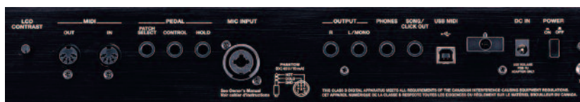
■ Rear Panel