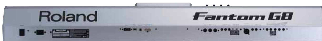
■ Rear Panel