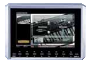
*Custom graphic interface of ARX-02