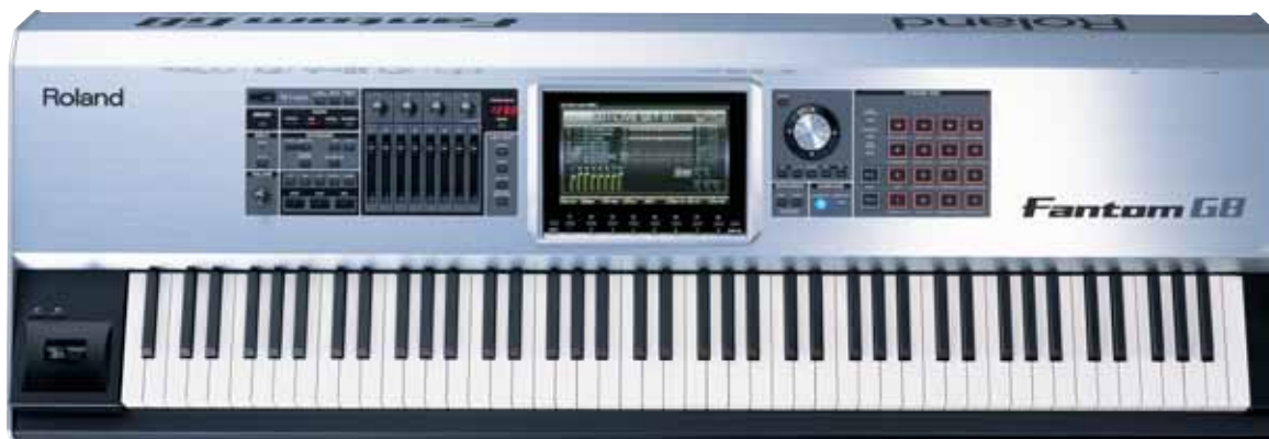
■ 88 keys