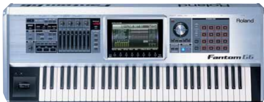
■ 61 keys