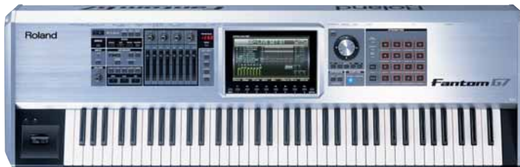
■ 76 keys