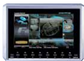
*Custom graphic interface of ARX-01