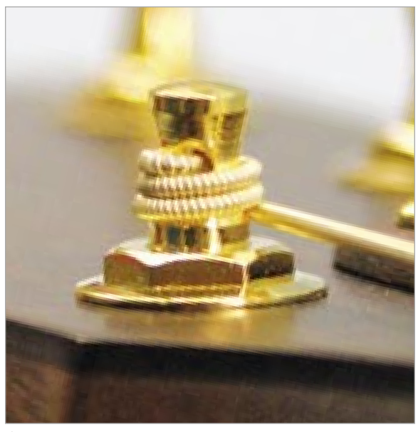
6. Tune the string to pitch. Two-to-three wraps is perfect for the bass strings. More is not better. Repeat the procedure to install the 5th string. As with the other bass strings, you will stretch the string the equivalent of one tuner's length past the post into which it's inserted.