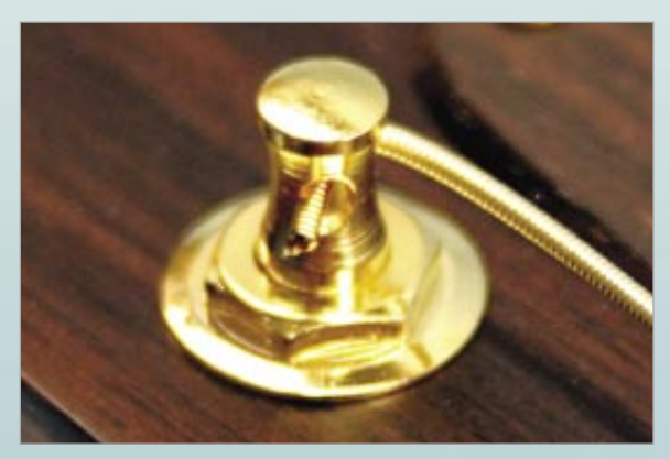
5. Turn the 6th string tuner so the hole in the tuner is at a 45-degree angle, then insert the 6th string and turn the tuner in a counterclockwise direction to tighten the string. The string end should protrude approximately 1/8th of an inch from the tuner hole.