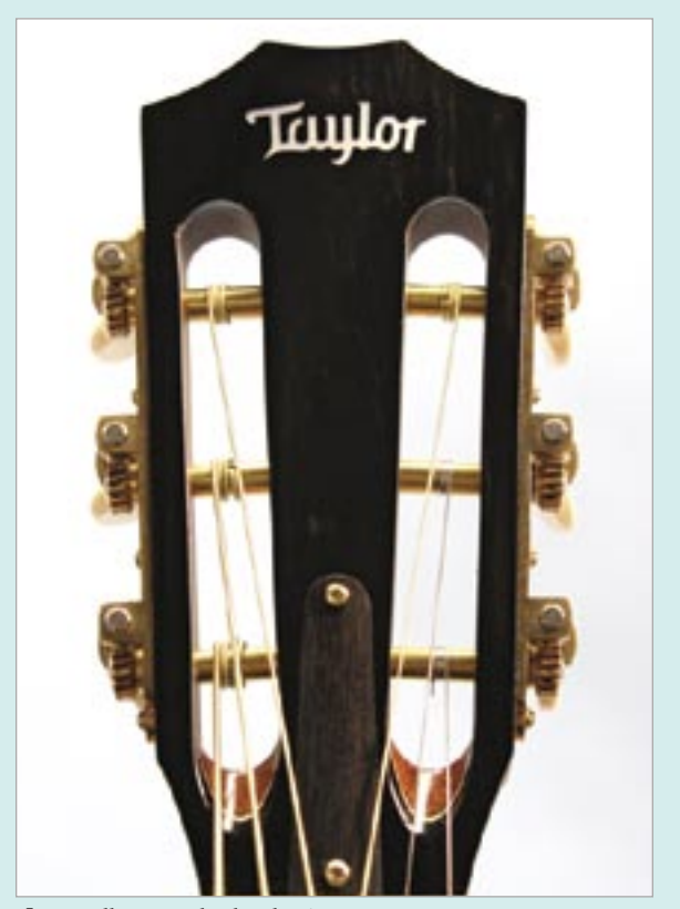
4. A well-strung slot-head guitar.