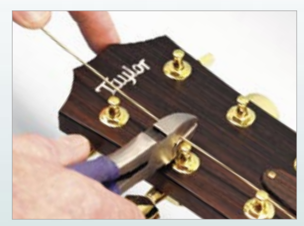
4. Stretch the 6th string over the peghead. Using wire cutters, trim the string at the 5th string post.

Push the bridge pin down and pull up on the ball end until it catches. Pull gently on the string to verify that it's "locked" in place.