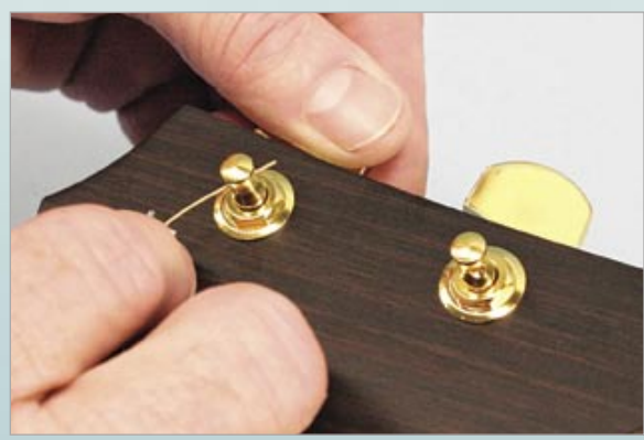
8. Trim the treble string ends 1-1/2 tuner's lengths past the post into which it's inserted. For the 3rd string, as well as for the other treble strings, the hole in the tuner should be at a 45-degree angle, as shown. Tighten the treble strings in a clockwise direction.