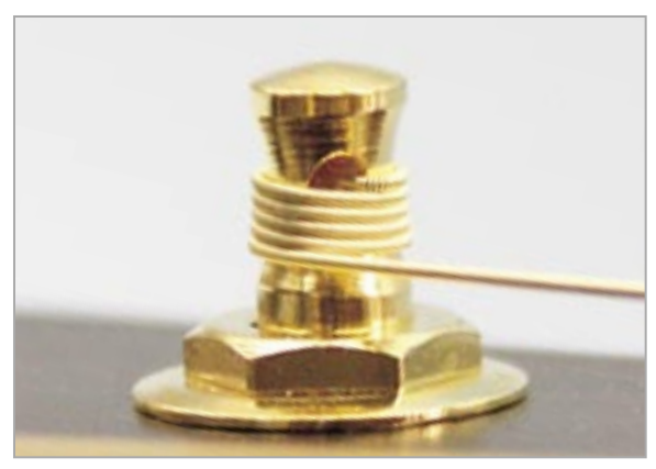
9. The treble strings (G, B, and High E) require approximately six wraps.