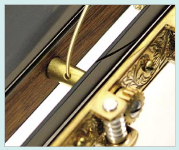
2. Position the tuner hole as shown and insert the string.