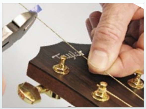
7. For the 4th string, you simply measure one tuner's length of slack before snipping the string and tightening.