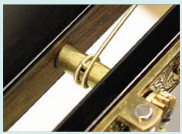
3. Here's the big difference: one wrap goes on the inside, the rest of the wraps go on the outside of the string end, toward the tuners.