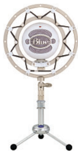
Snowball mounted on The Ringer

Once safely mounted, connect the Snowball to the USB port on your Macintosh or Windows computer (the Snowball is USB 2.0 compatible — see the right sidebar for full system requirements). Make sure that the active, on-axis side of the diaphragm (the side with the BLUE logo) is facing the desired source. When connected, the LED just above the Blue logo will glow red, indicating power has reached the Snowball and it is ready to roll. For additional set-up information and FAQs about the Snowball, visit the Blue Microphones website at www.bluemic.com , then click on the Snowball link at the top of the home page.