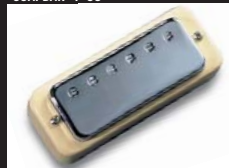
CHROME COVERED MINI-HUMBUCKER