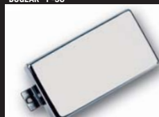
CHROME TONY IOMMI HUMBUCKER