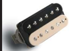
"ZEBRA" OPEN COIL HUMBUCKER