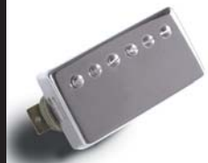
CHROME COVERED HUMBUCKER