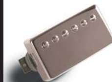
NICKEL COVERED HUMBUCKER