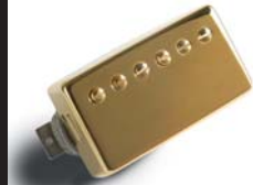
GOLD COVERED HUMBUCKER