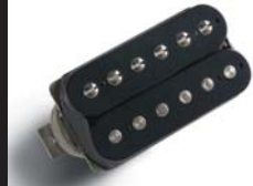
BLACK OPEN COIL HUMBUCKER