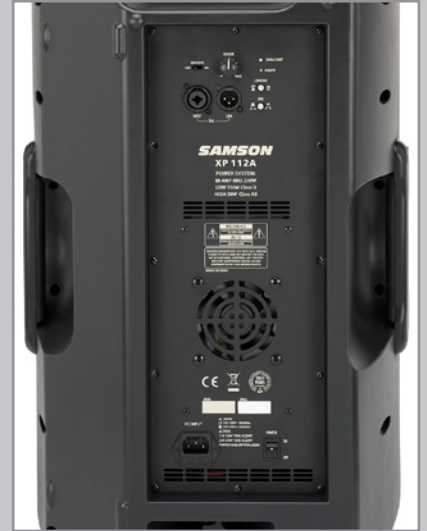
Expedition XP112A back panel