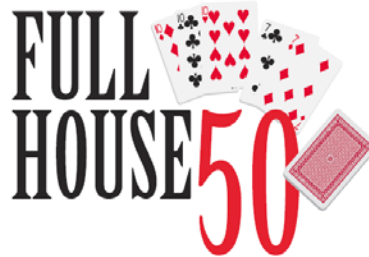
Table of Contents (by section)